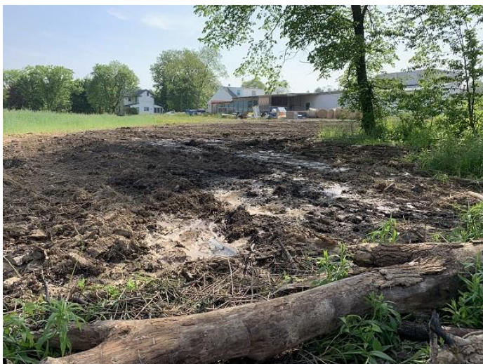
Discharge of wastewater seep to the waterway