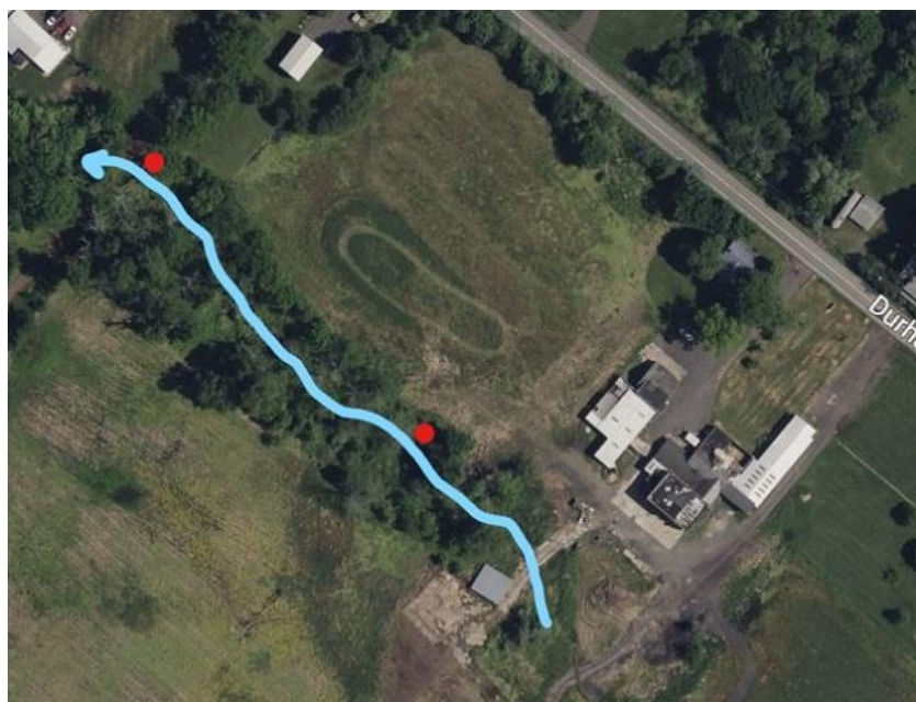
Site overview showing wastewater discharge locations to the tributary