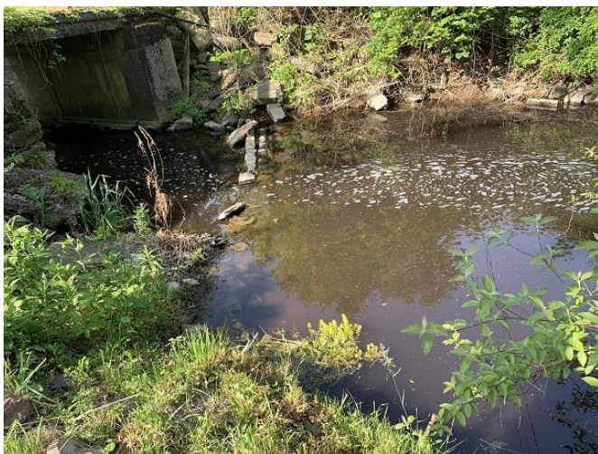
Dark tinted tributary at the monitored location

A copy of this report will be forwarded to the PA FBC and the Bucks County Health Department.