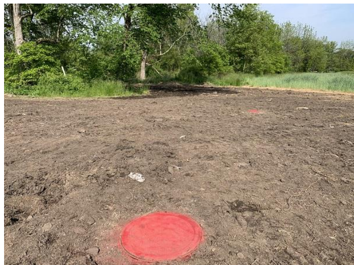
Wastewater system manhole. Seep discharge point is at rear