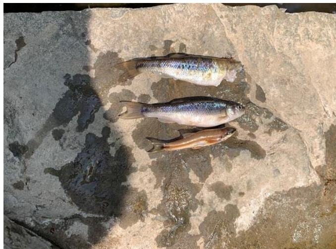
Dead minnows at the monitored location