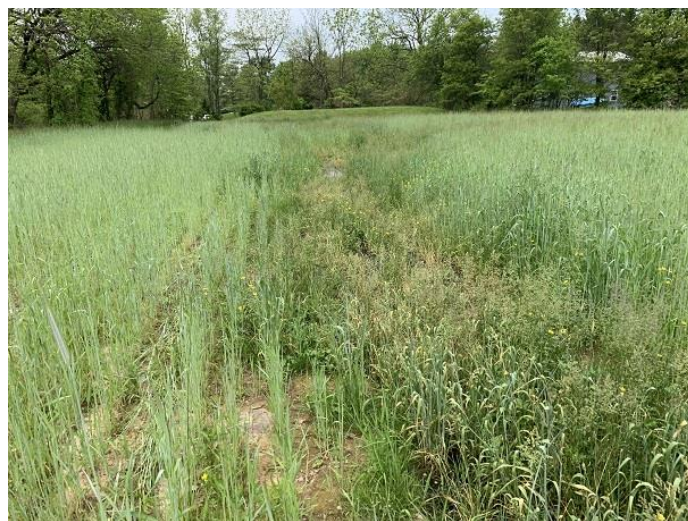
Path of wastewater toward the septic mound