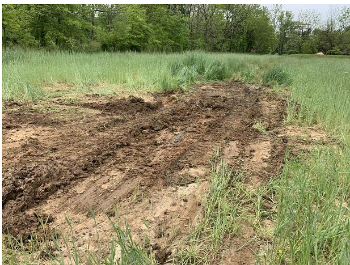
Excavation of a field seep