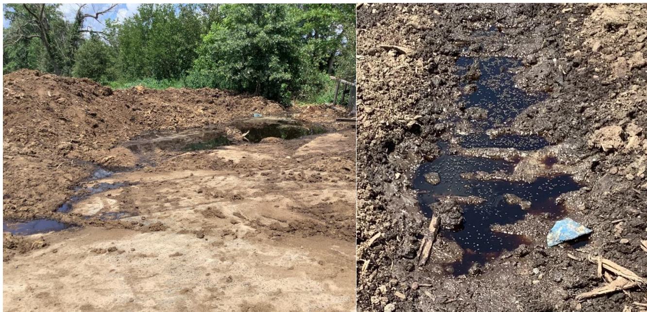
Image 3: Discolored standing water in compost pile Taken by Molly Goodman on 7/31/2023 at 13:05