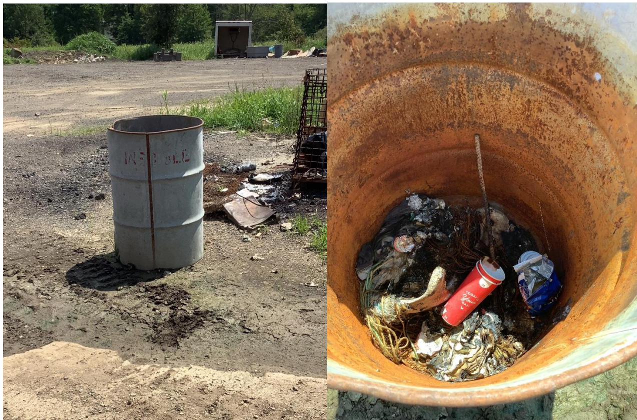
Image 1: Burn barrel containing a conglomerate of solid waste and animal remains Taken by Molly Goodman on 7/31/2023 at 13:03