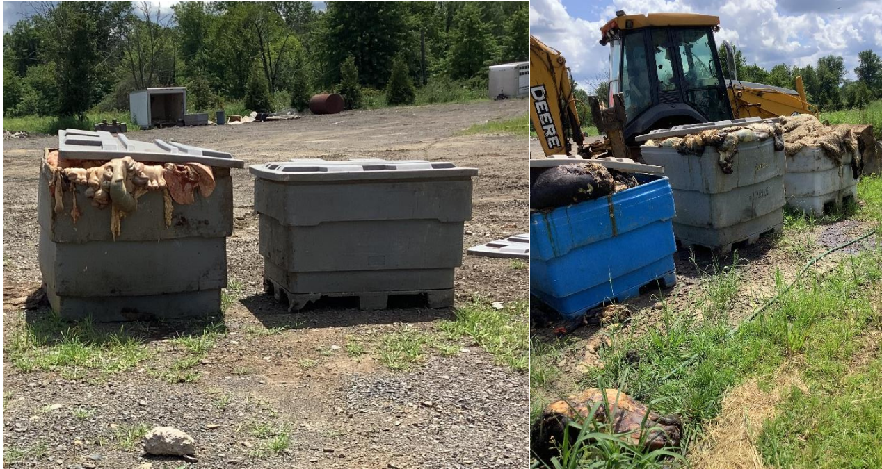
Image 4: Containers of entrails, heads and skins of slaughtered animals Taken by Molly Goodman on 7/31/2023 at 12:50