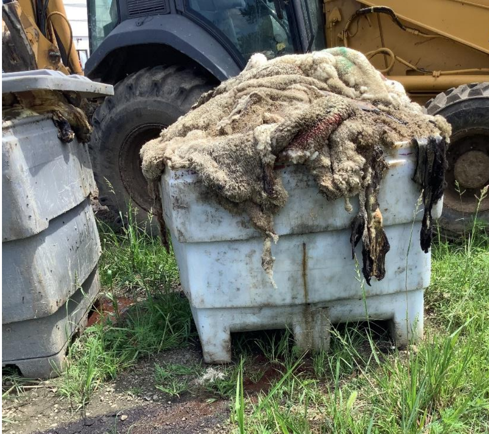
Image 5: Overflowing, uncovered container of animal skins Taken by Molly Goodman on 7/31/2023 at 12:52