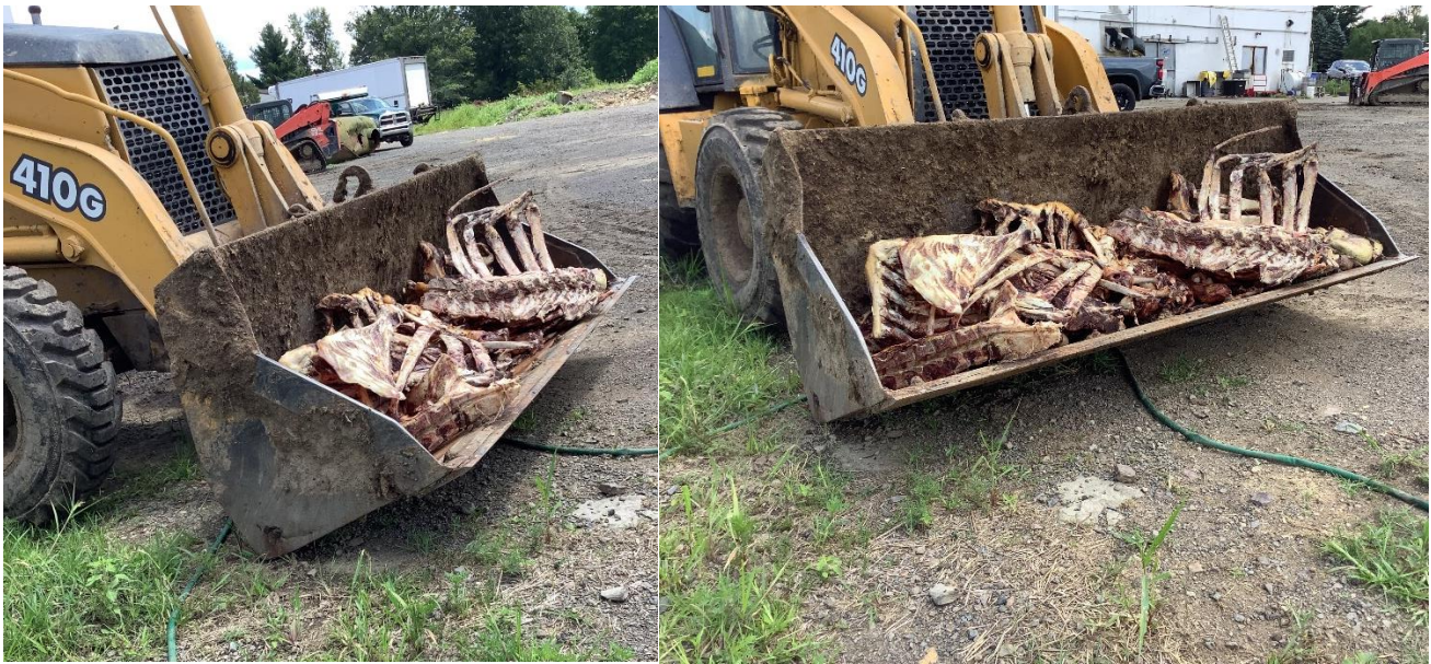
Image 6: Cow backbones stored in bucket of backhoe Taken by Molly Goodman on 7/31/2023 at 12:59