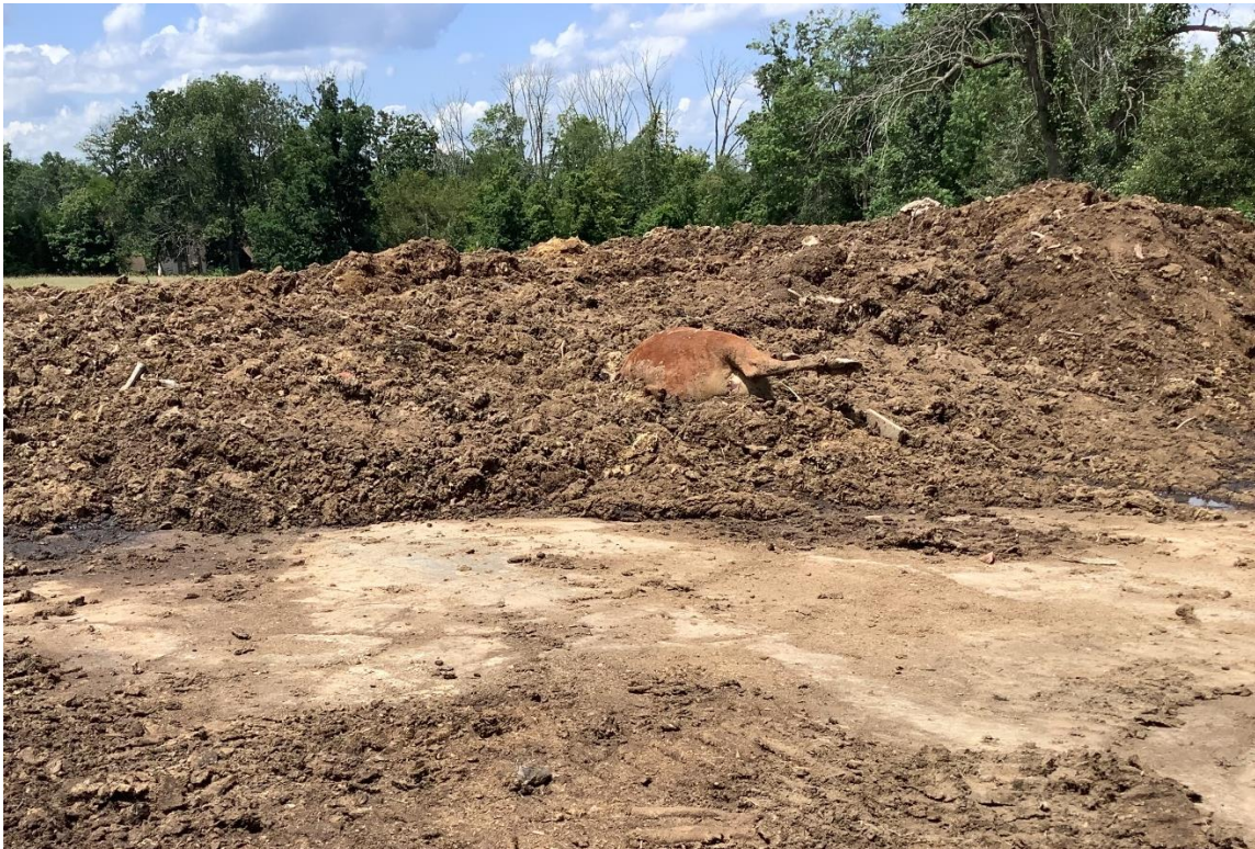
Image 2: Carcass exposed in compost pile Taken by Molly Goodman on 7/31/2023 at 13:05